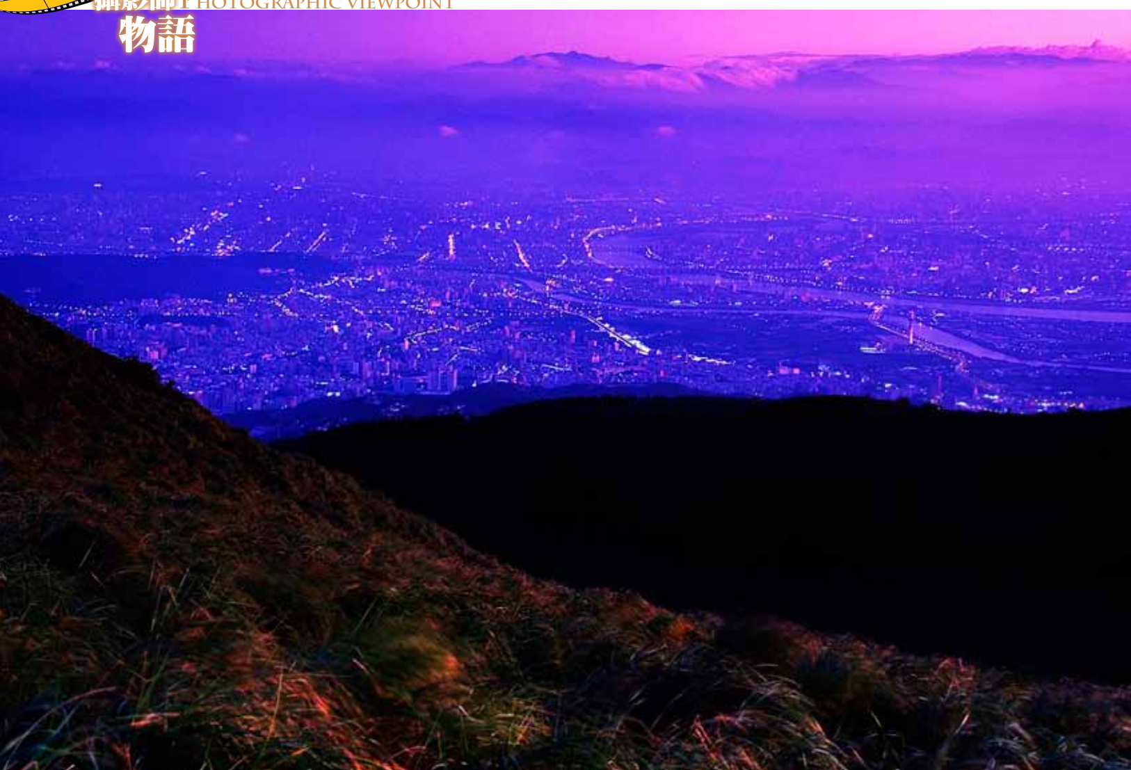
華燈初上：2009 陽明山國家公園「草山意象」攝影比賽佳作。 Nightfall: Excellence Award of 2009 Yangmingshan National Park Caoshan Image Photography Contest

胡彩鳳喜歡爬山、健行。當初偶然參加一個登山團體，在一年的時間內幾乎走遍桃竹苗的中級山，後來為了鍛鍊體能，更登上玉山、雪山、合歡群峰等百岳。高山上氣象瞬息萬變，景色美不勝收，她想將難以言喻的美記錄下來，買了第一台數位單眼相機的她，立刻報名攝影課程。啟蒙老師陳春隆先生精闢的講課方式，激發了她的學習興趣。如今，她不但經營攝影部落格，也積極參加各類攝影比賽，將參賽視作提升攝影功力的動能。