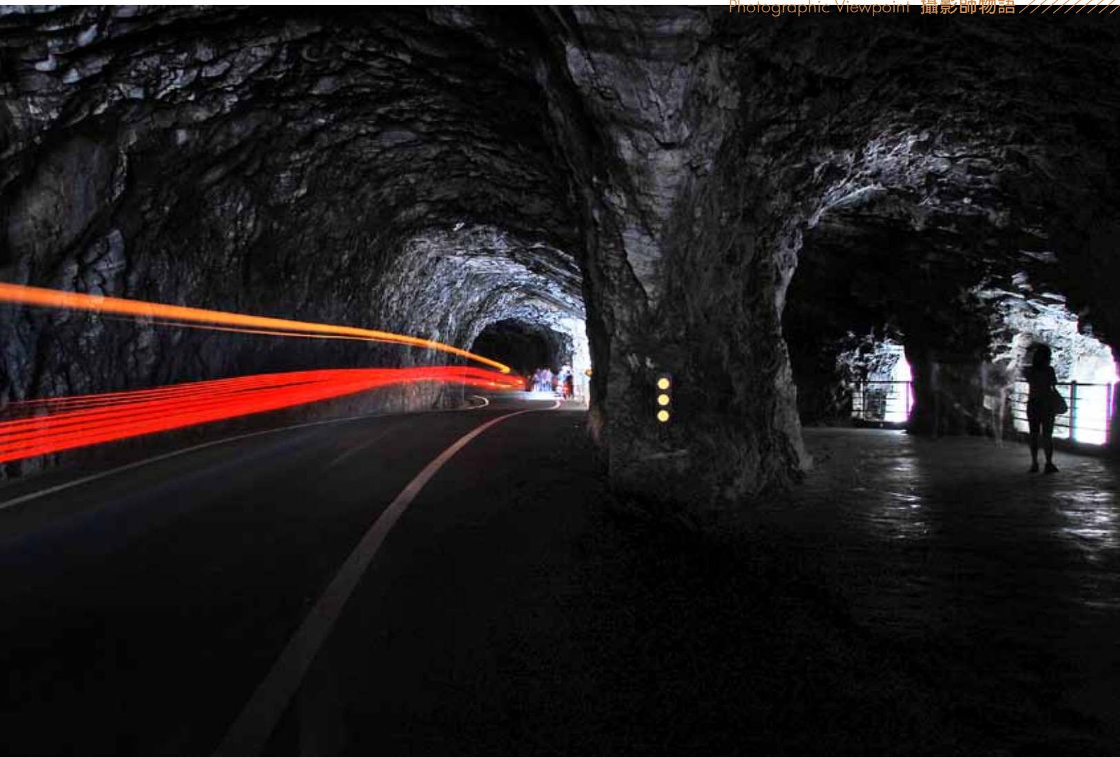
別有洞天：獲 eye 上國家公園攝影比賽銀牌獎。 Another World: Silver Award of Eyes on the National Parks Photography Contest

〈別有洞天〉評審評析：本作品利用對稱的美——兩個並列的峽谷岩洞，及不對稱的美——車的動態的軌跡與人駐足的靜態剪影，看出作者的獨特巧思。